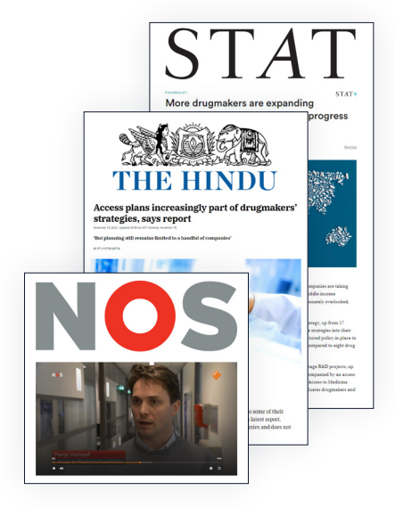
A selection of the media coverage for the 2022 Access to Medicine Index.