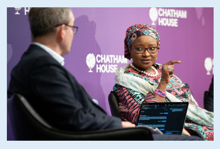
Global health experts joined the panel for the launch of the Access to Medicine Index in London.