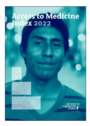
The eighth Access to Medicine Index was published in November 2022.

The Foundation has been calling for companies, via their respective report cards, to ensure access to their new products in LMICs by planning ahead for access while projects are still in the R&D phase. In recent editions of the Index, improvements around access planning have been highlighted as an opportunity to several companies including AstraZeneca (since its 2016 Index report card), and Novartis (since its 2018 Index report card). Encouraging findings in the 2022 Index indicate the impact of the Foundation's efforts to highlight the importance of access planning, and measure companies' actions in this area. Six companies – Astellas, Boehringer Ingelheim, Johnson & Johnson, Merck, Novartis, and Takeda – now have access plans in place for all of their late-stage R&D projects in scope, marking the first time any of the 20 companies have reached this milestone. Some other companies are close behind: 95% of AstraZeneca's late-stage products were covered by an access plan.