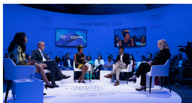
In May, The Foundation participated in a panel on strengthening health systems at the World Economic Forum.