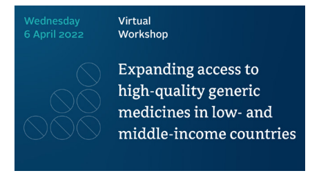
The Foundation hosted a workshop on the role of generic medicine manufacturers in expanding access to essential medicines.

To discuss and ratify the research areas, themes and assessment parameters of the analytical framework prior to its publication, the team established an Expert Committee, consisting of representatives from industry associations, investors, research and academic institutions, international organisations and NGOs. The committee met in November to provide strategic guidance, ensuring that the framework represents areas where industry analysis will have the greatest potential to influence and inspire change-making in expanding access to medicine.