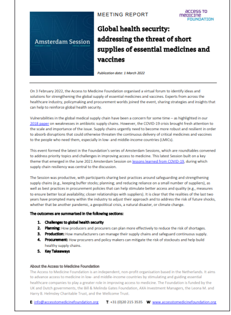
In February, the Foundation hosted an Amsterdam Session on global health security and published a follow-up report.