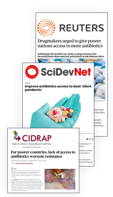
The Foundation's report on AMR and appropriate access generated global media coverage.